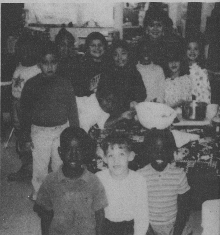
Garwood 1st graders make cookies